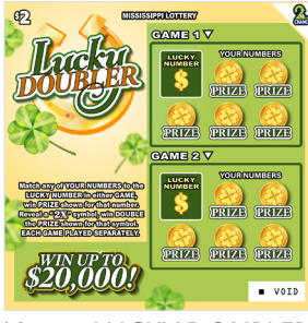
Name: LUCKY DOUBLE Price Point: $2 Overall Odds: 4.47 Game #: 194