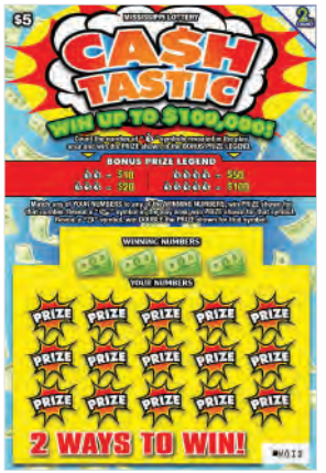
Name: CA$HTA$TIC Price Point: $5 Overall Odds: 4.05 Game #: 160