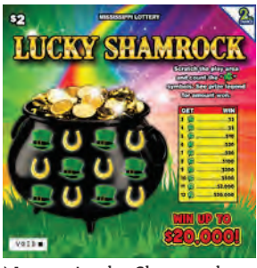
Name: Lucky Shamrock Price Point: $2 Overall Odds: 4.66 Game #: 85