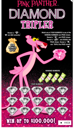
Name: PINK PANTHER™ DIAMOND TRIPLER Price Point: $5 Overall Odds: 4.26 Game #: 195