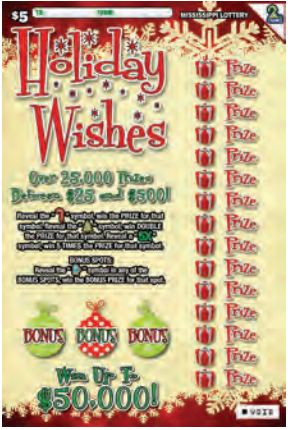
Name: Holiday Wishes Price Point: $5 Overall Odds: 4.35 Game #: 78