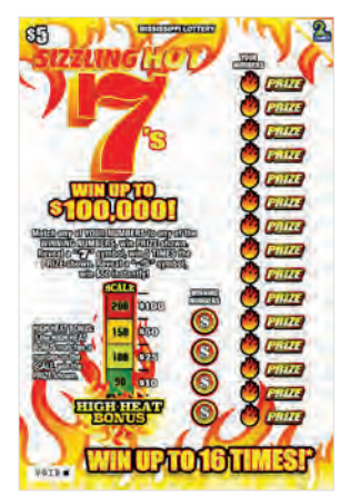
Name: Sizzling Hot 7s Price Point: $5 Overall Odds: 4.47 Game #: 90