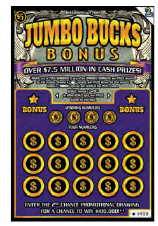
Name: Jumbo Bucks Bonus Price Point: $5 Overall Odds: 4.02 Game #: 96