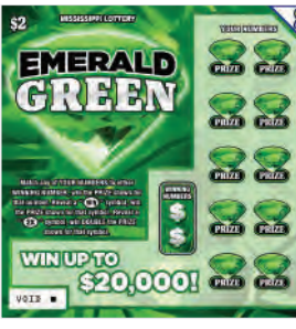
Name: EMERALD GREEN Price Point: $2 Overall Odds: 4.54 Game #: 181