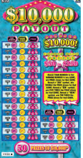
Name: $10,000 Payout Price Point: $10 Overall Odds: 3.83 Game #: 116