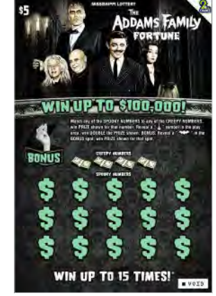
Name: The Addams Family Fortune Price Point: $5 Overall Odds: 4.03 Game #: 110