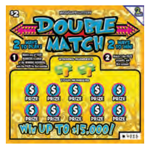
Name: Double Match Price Point: $2 Overall Odds: 4.66 Game #: 79