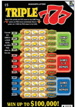
Name: Triple 777 Price Point: $5 Overall Odds: 4.78 Game #: 98